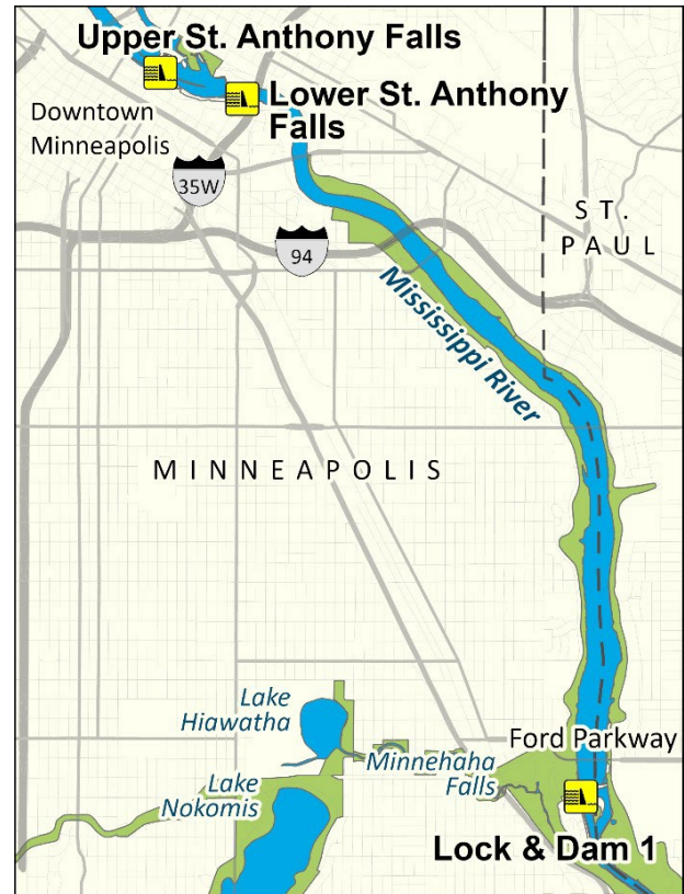
Twin Cities Locks and Dams ntawm Mississippi River

Xyoo 2016, Lub Tuam Txhab tau kawm txog kev tshem tawm ntawm Minneapolis 'peb qhov thaiv thiab dams. Xyoo 2018, Lub Tuam Txhab tau thov kom cais qhov Upper St. Anthony Falls los ntawm Lower St. Anthony Falls thiab Lock and Dam 1 Kawm.