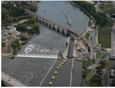
Upper St. Anthony Falls