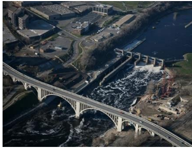
Lower St. Anthony Falls